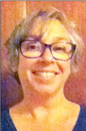
Rita Capezzi, Interim Intern Minister

The power for creating a better future is contained in the present moment: You create a good future by creating a good present.